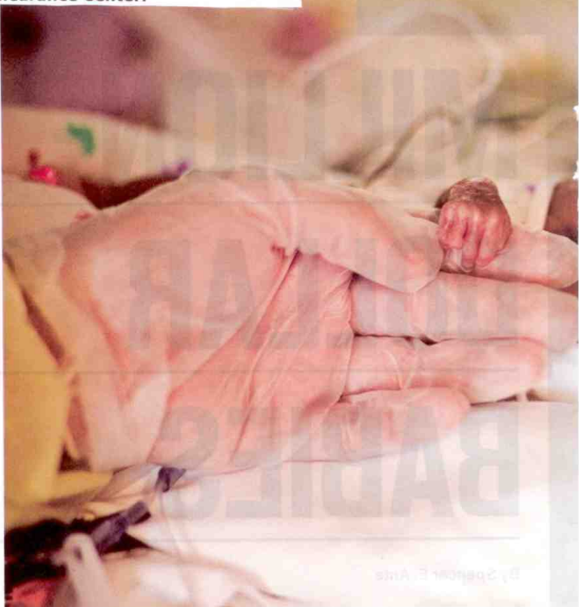
Staff care for a preemie at Children's National Medical Center in Washington, D.C.

The cost calculations are just as controversial, but most health-care economists seem to agree that spending on preemies offers a high rate of return for all but the earliest-stage infants. The reason? The money improves both the quality and length of life, which yields big economic benefits. Between 1960 and 2000, the U.S. infant mortality rate—the rate at which babies less than 1 year of age die—dropped 73%. It fell from 26.0 to 6.9 deaths per 1,000 live births, accord-